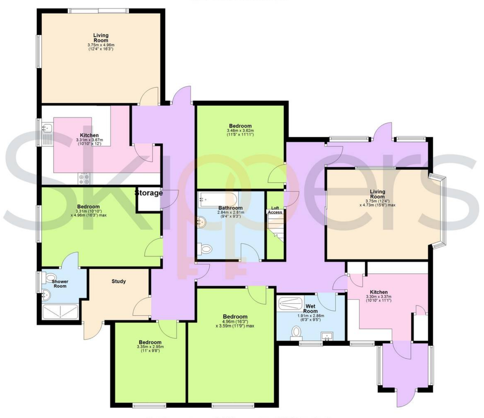
Total area: approx. 177.7 sq. metres (1912.9 sq. feet)

Ground Floor Approx. 177.7 sq. metres (1912.9 sq. feet)