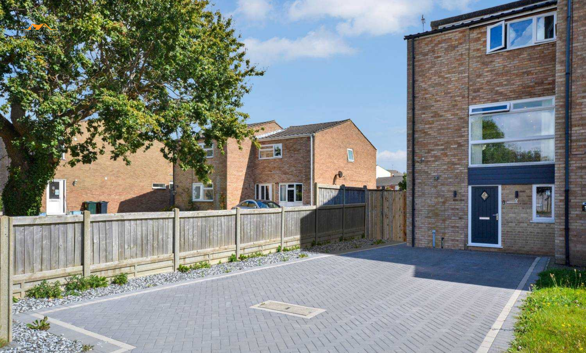
9 Summerhill Cuckoo Lane, Ashford £275,000