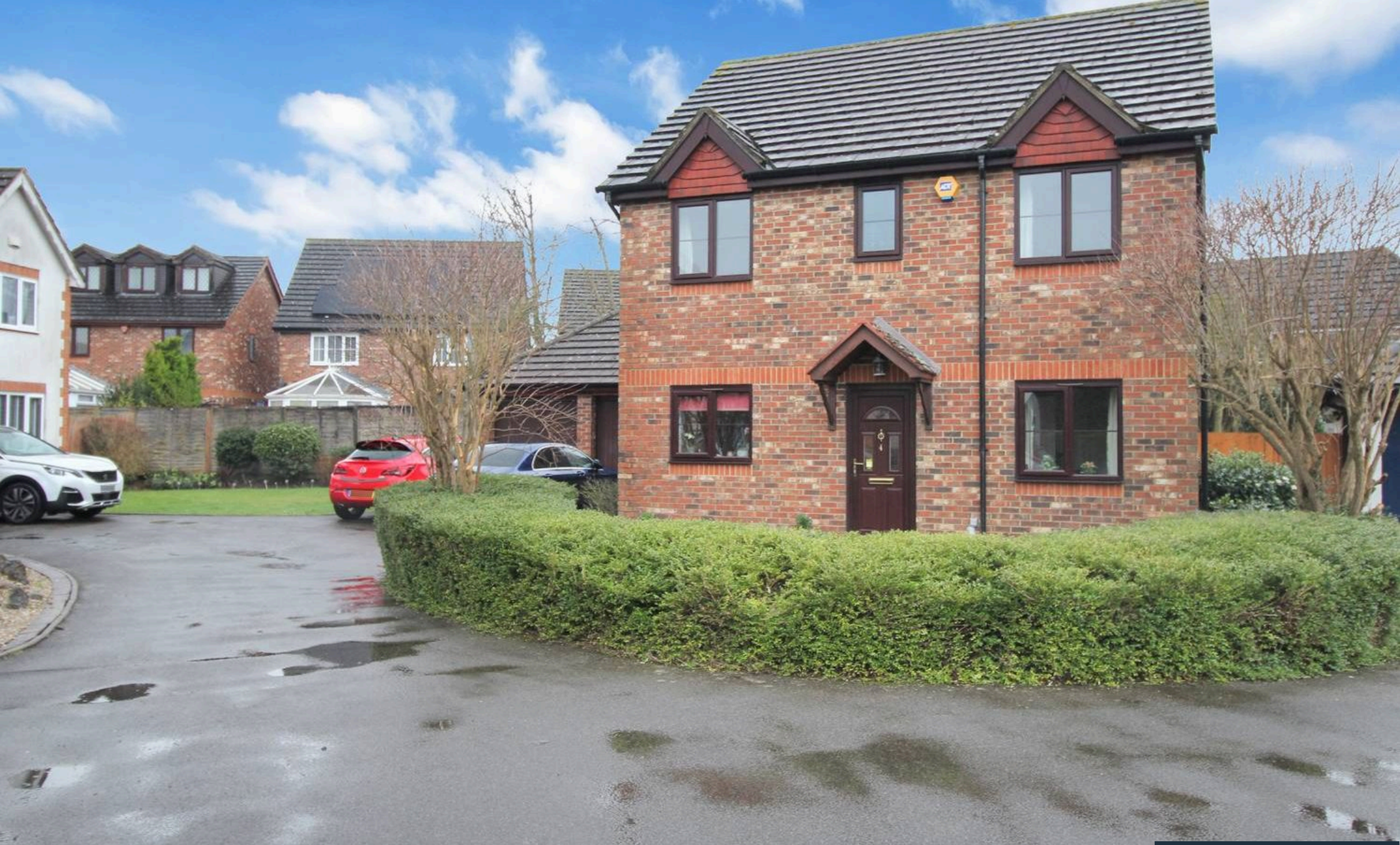
4 Bluebell Road, Kingsnorth £475,000