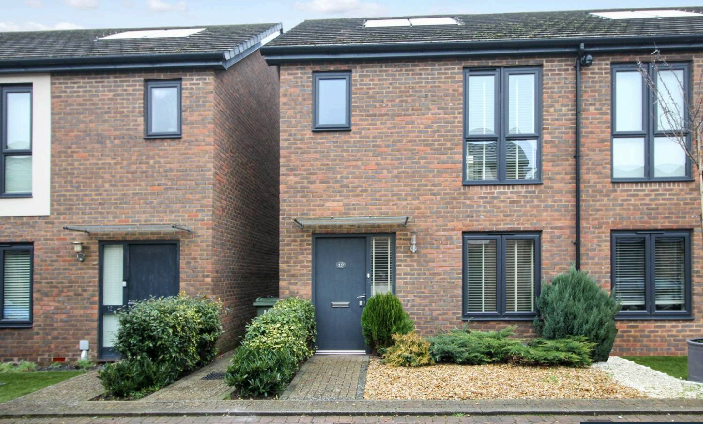
10 Romney Crescent, Ashford £1,400 pcm