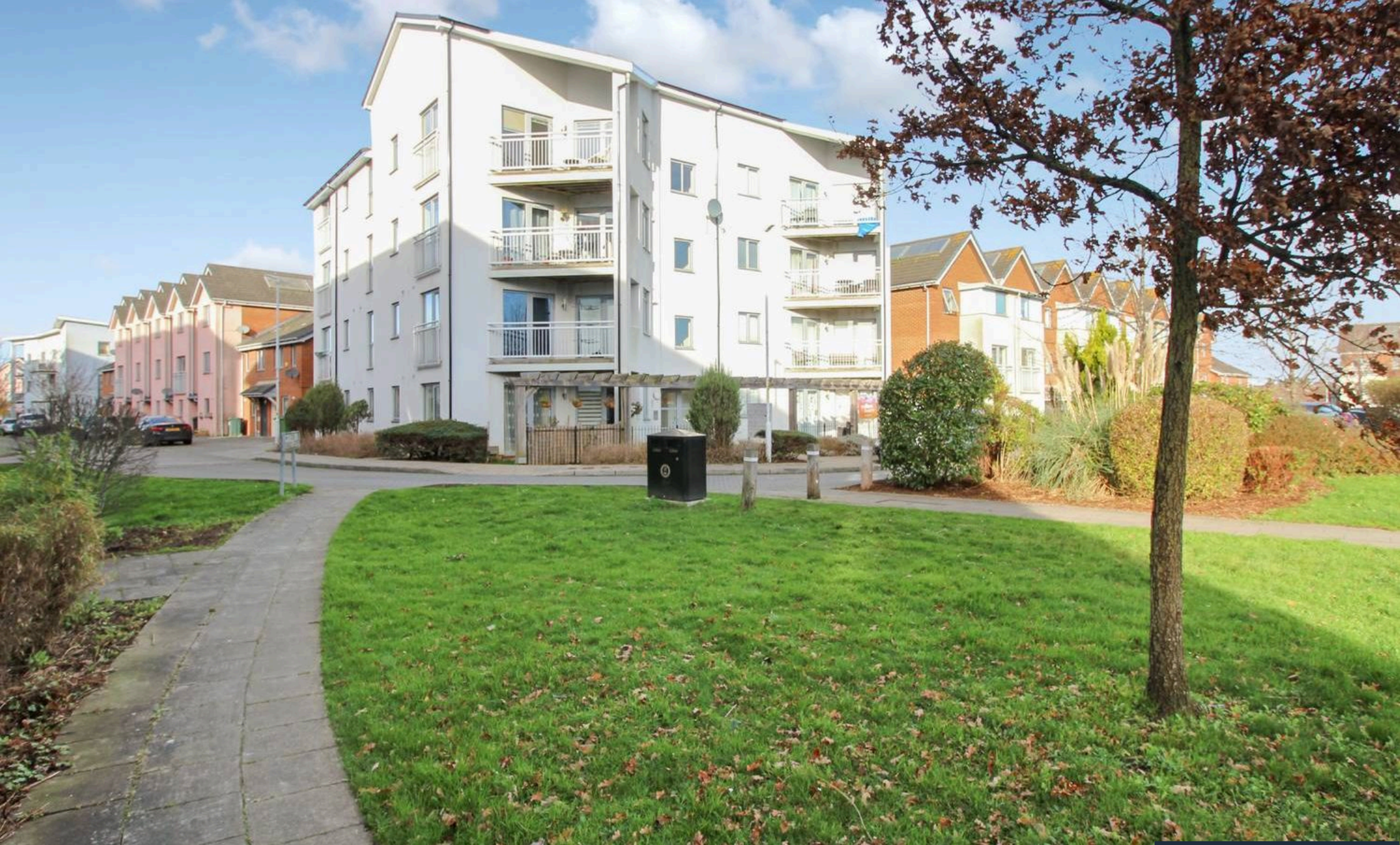
40 Drummond Grove, Willesborough £175,000