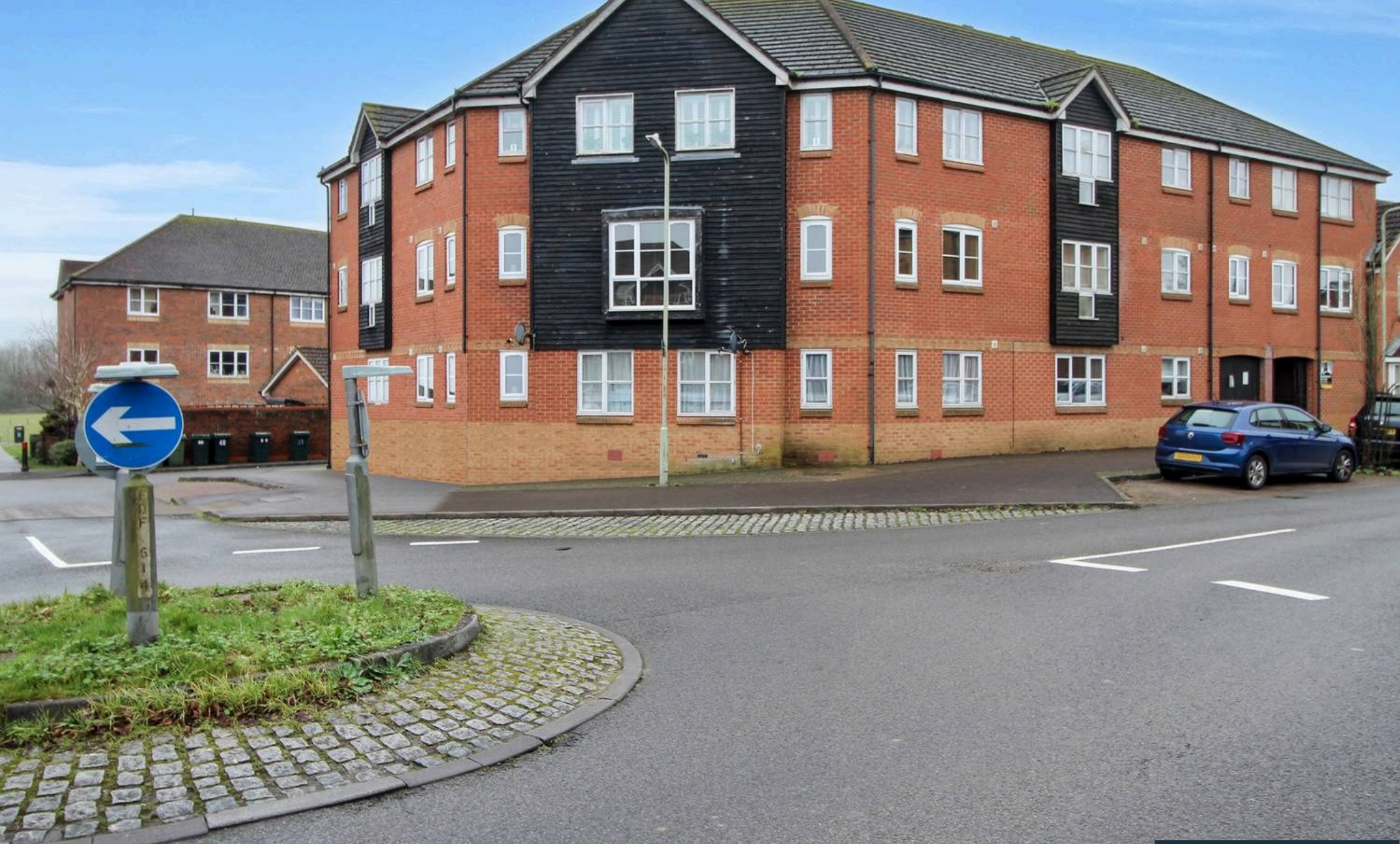
61 East Stour Way, Ashford £165,000