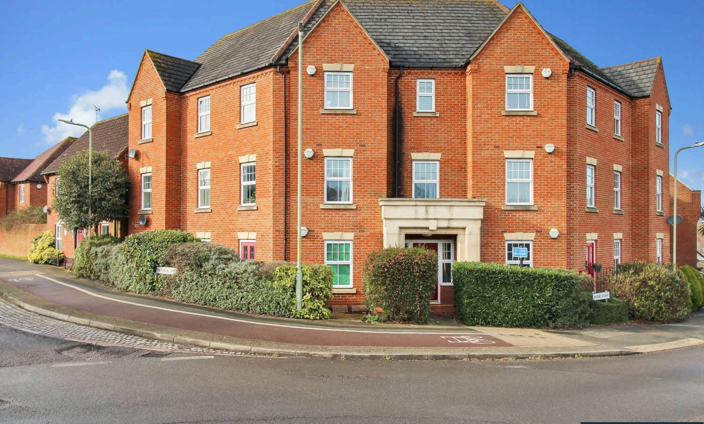
7 Kirk View, Ashford £210,000