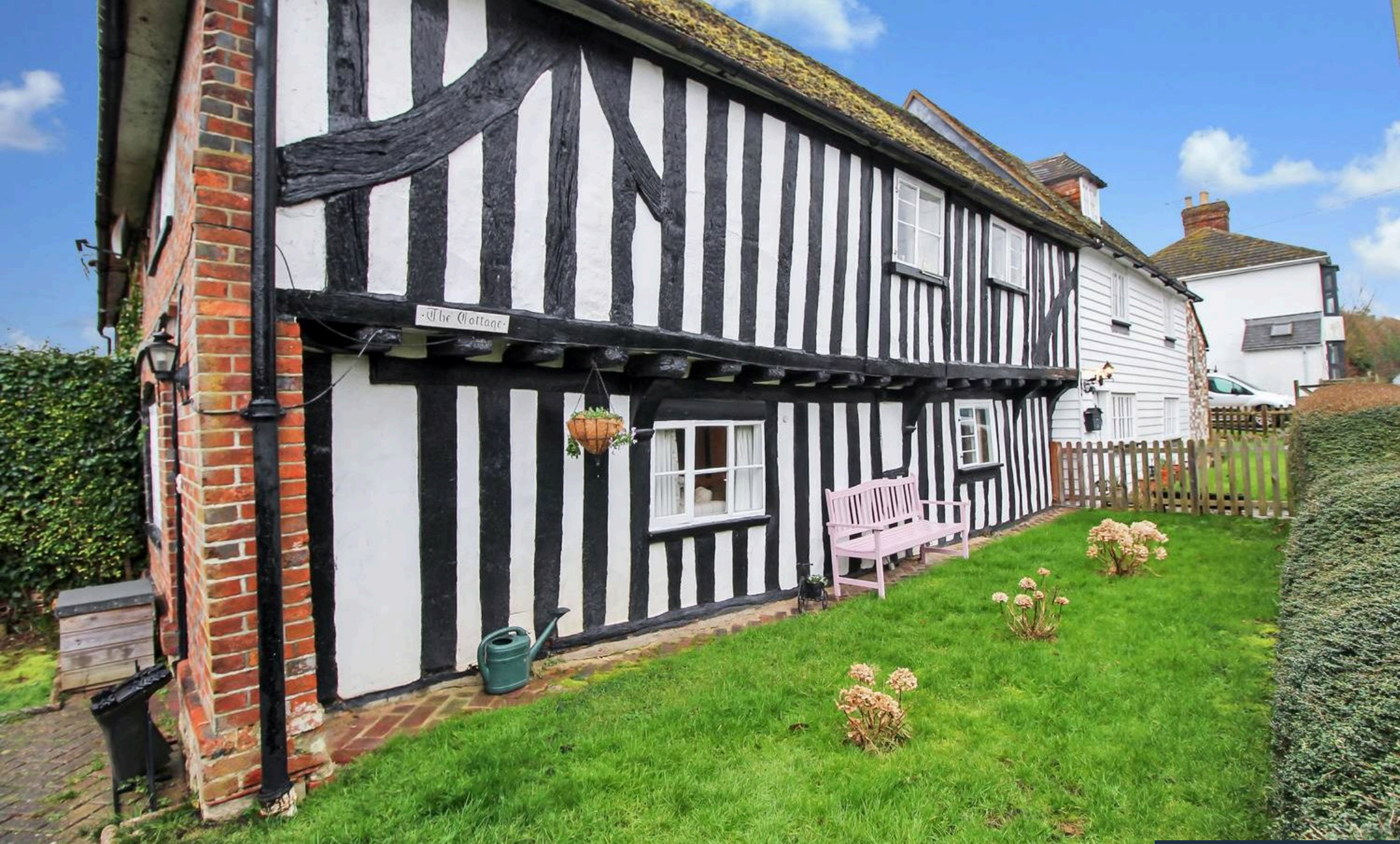
The Cottage, Bilsington £400,000