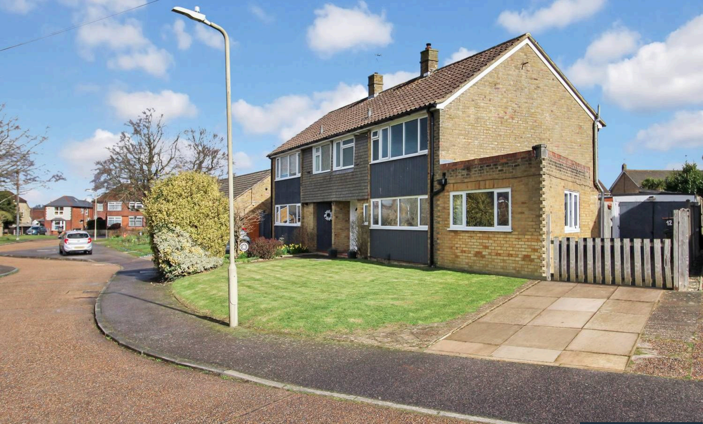
12 Waterside, Willesborough £375,000