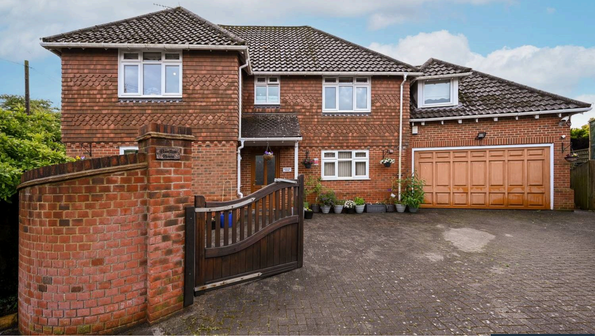
Hamilton House Kinneys Lane, Kennington £650,000