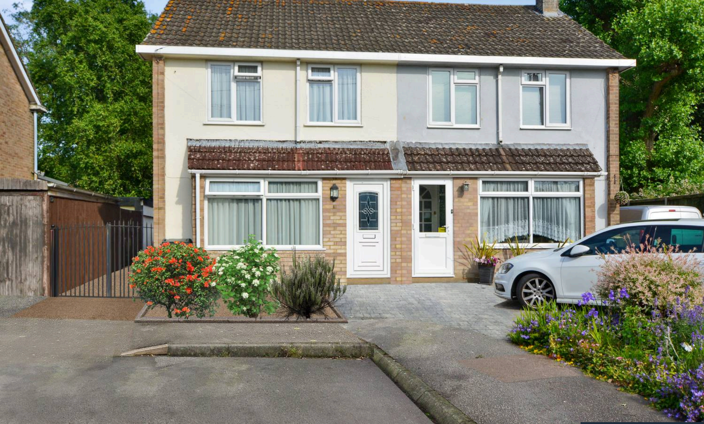
54 Waterside, Willesborough £350,000