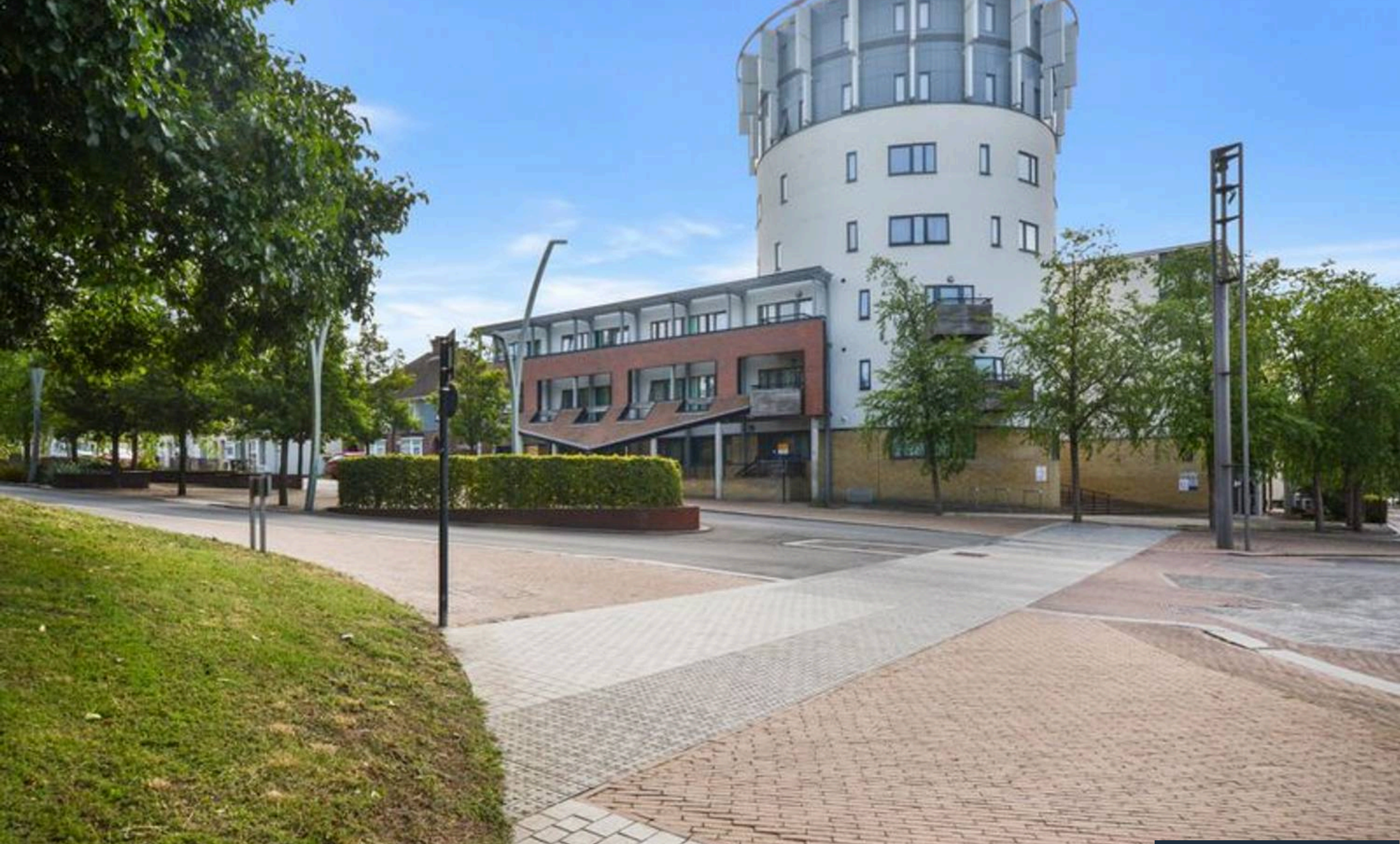
6 Tower Point Godinton Road, Ashford £200,000