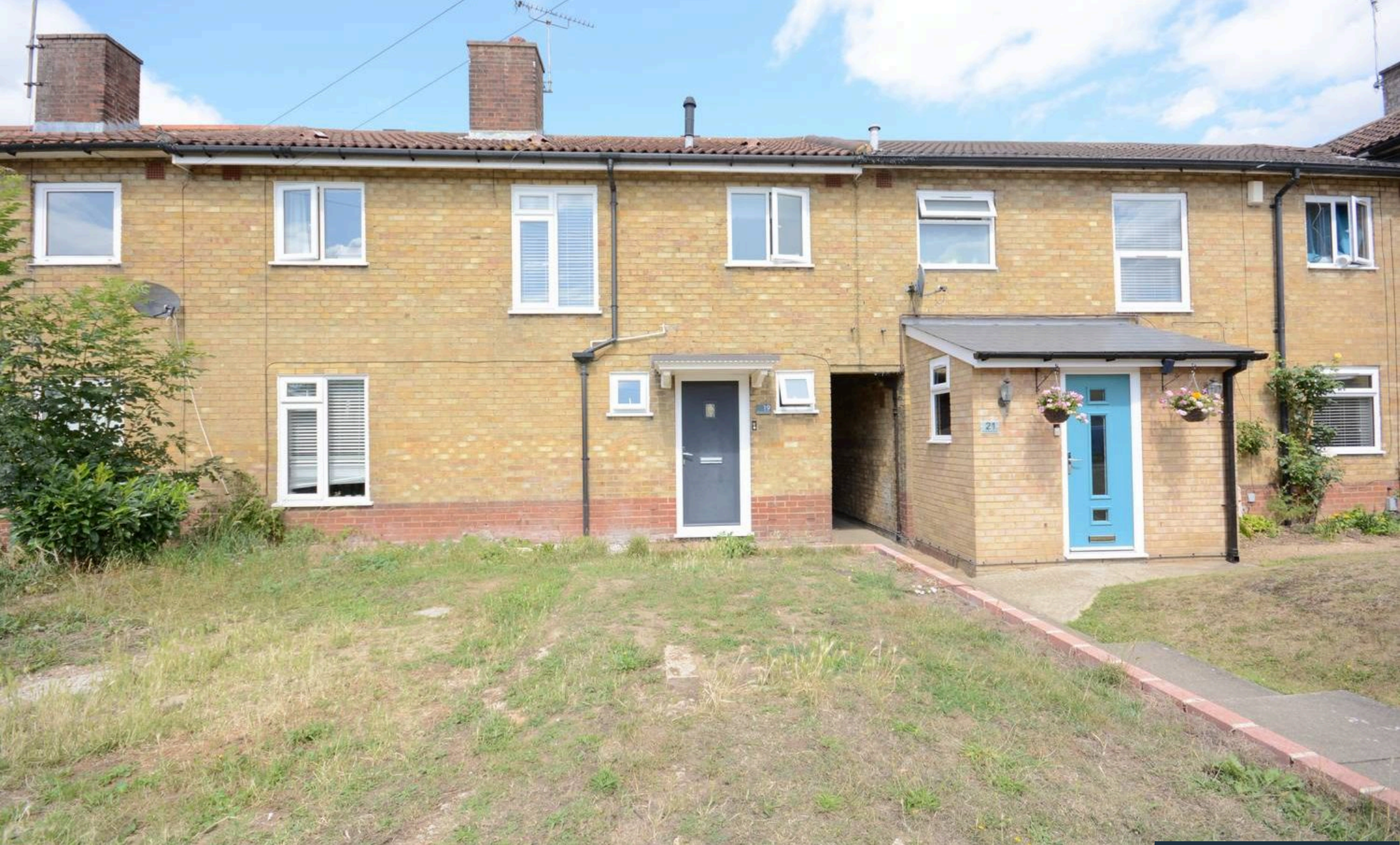
19 Breadlands Road, Willesborough £325,000