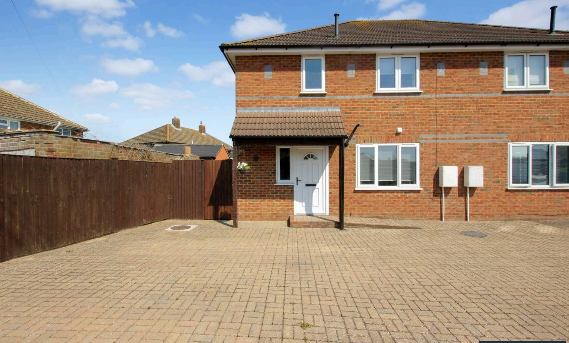
Water Tower View St. Marys Road, New Romney £425,000