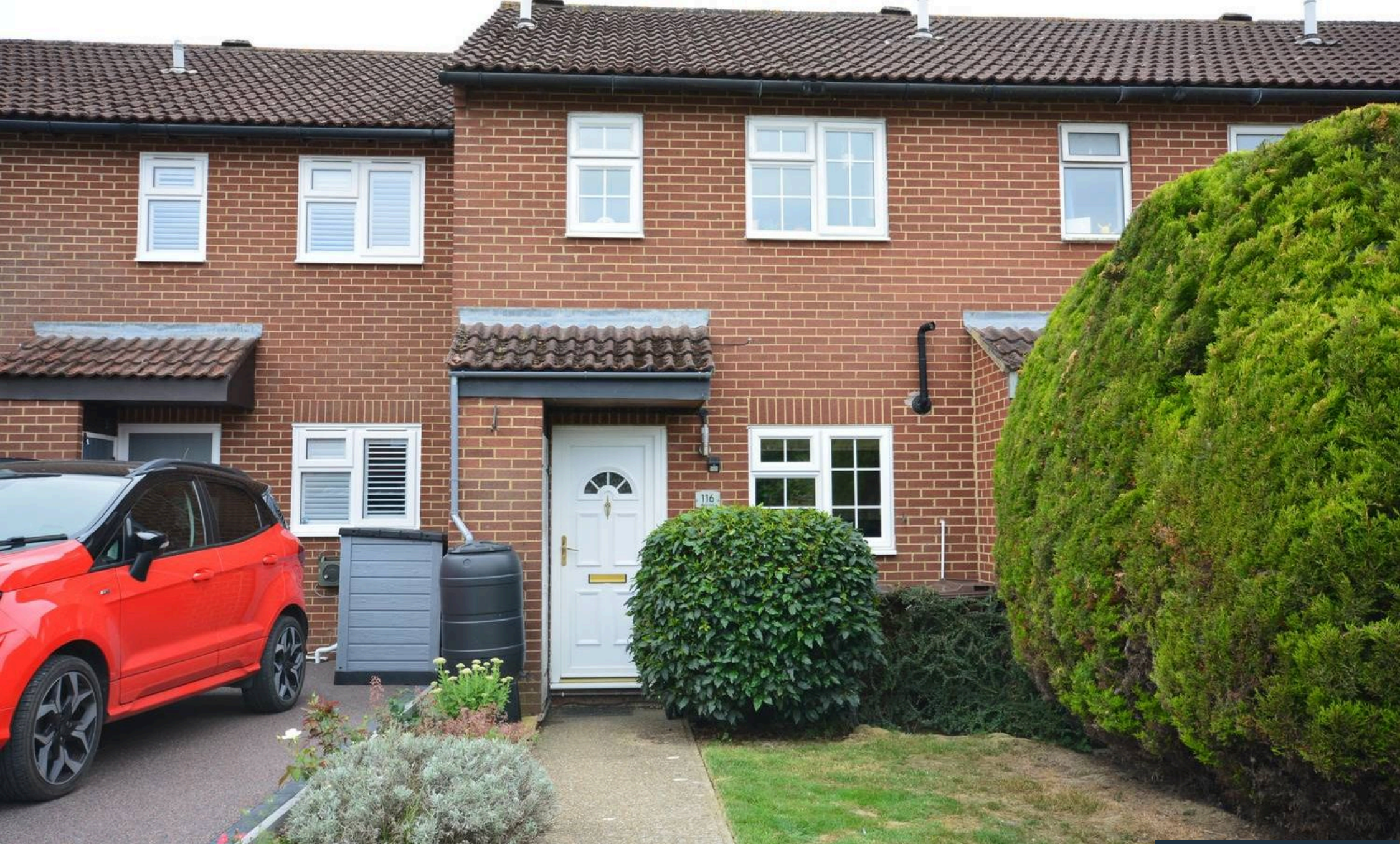
116 Manorfield, Ashford £250,000