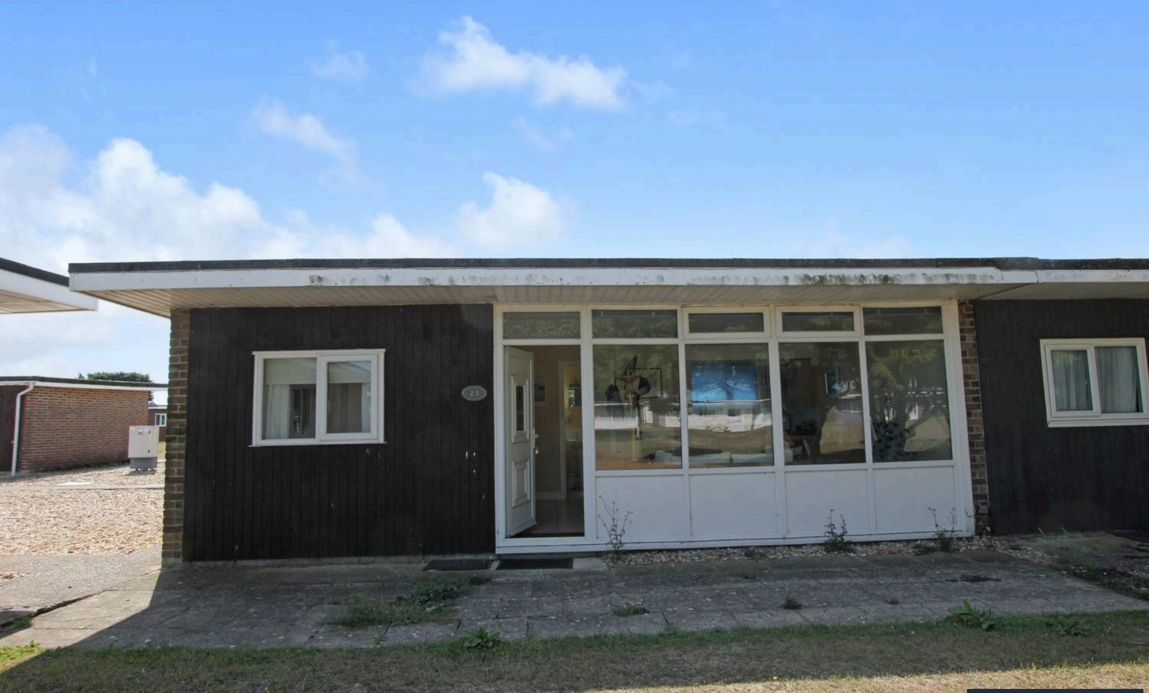
Romney Sand Holiday Village, The Parade, Greatstone £8,000