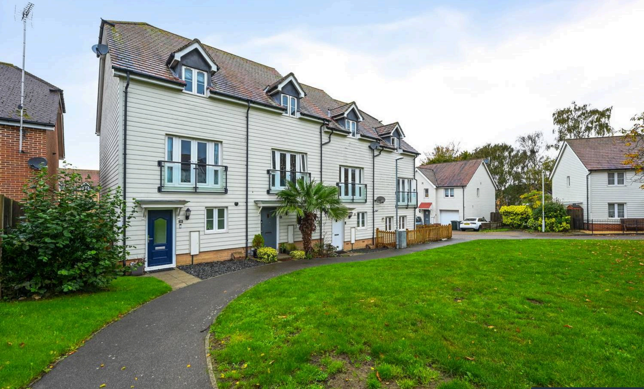
35 Greystones, Willesborough £365,000