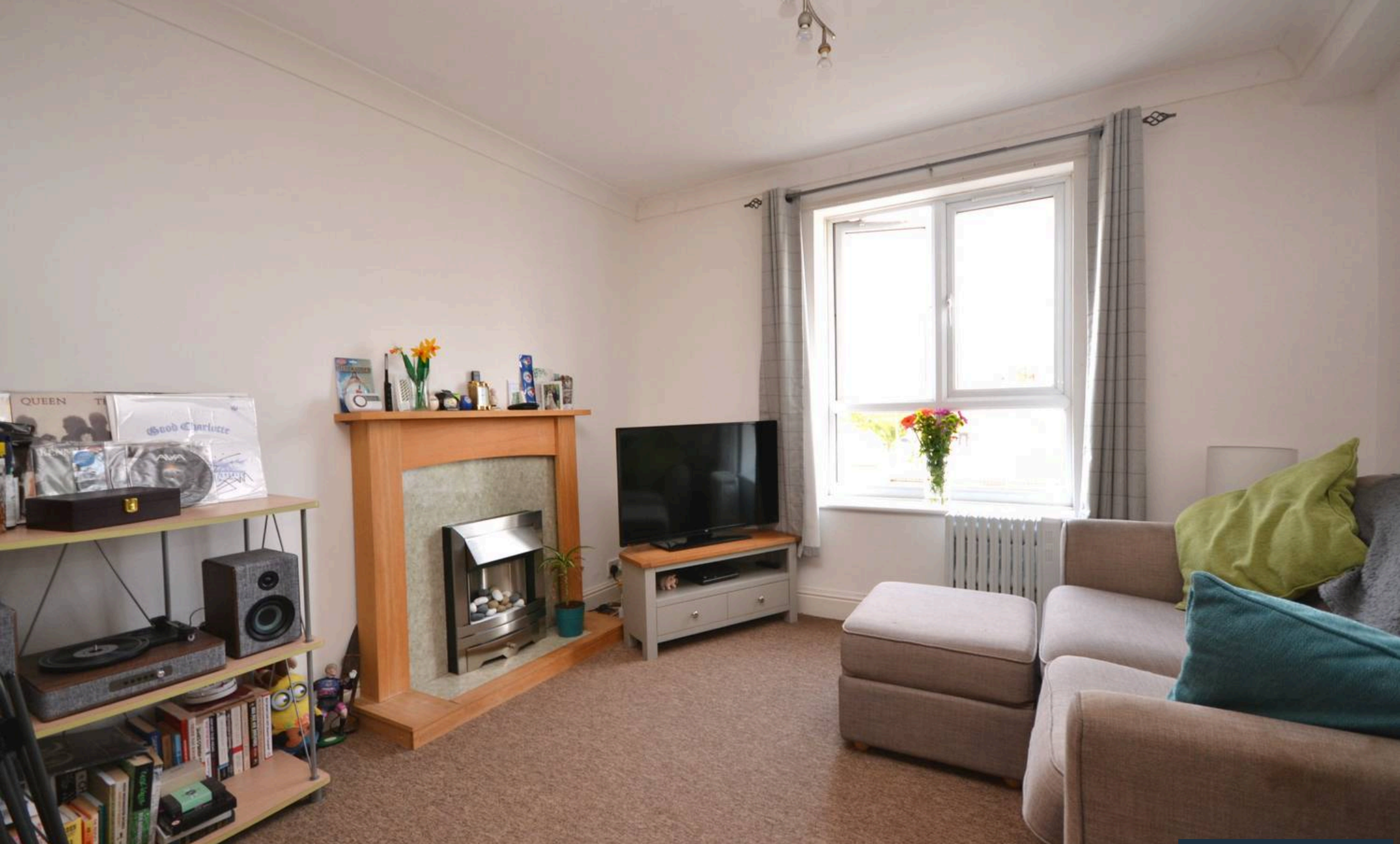
Flat 9, Bank House Mountfield Road, New Romney £125,000