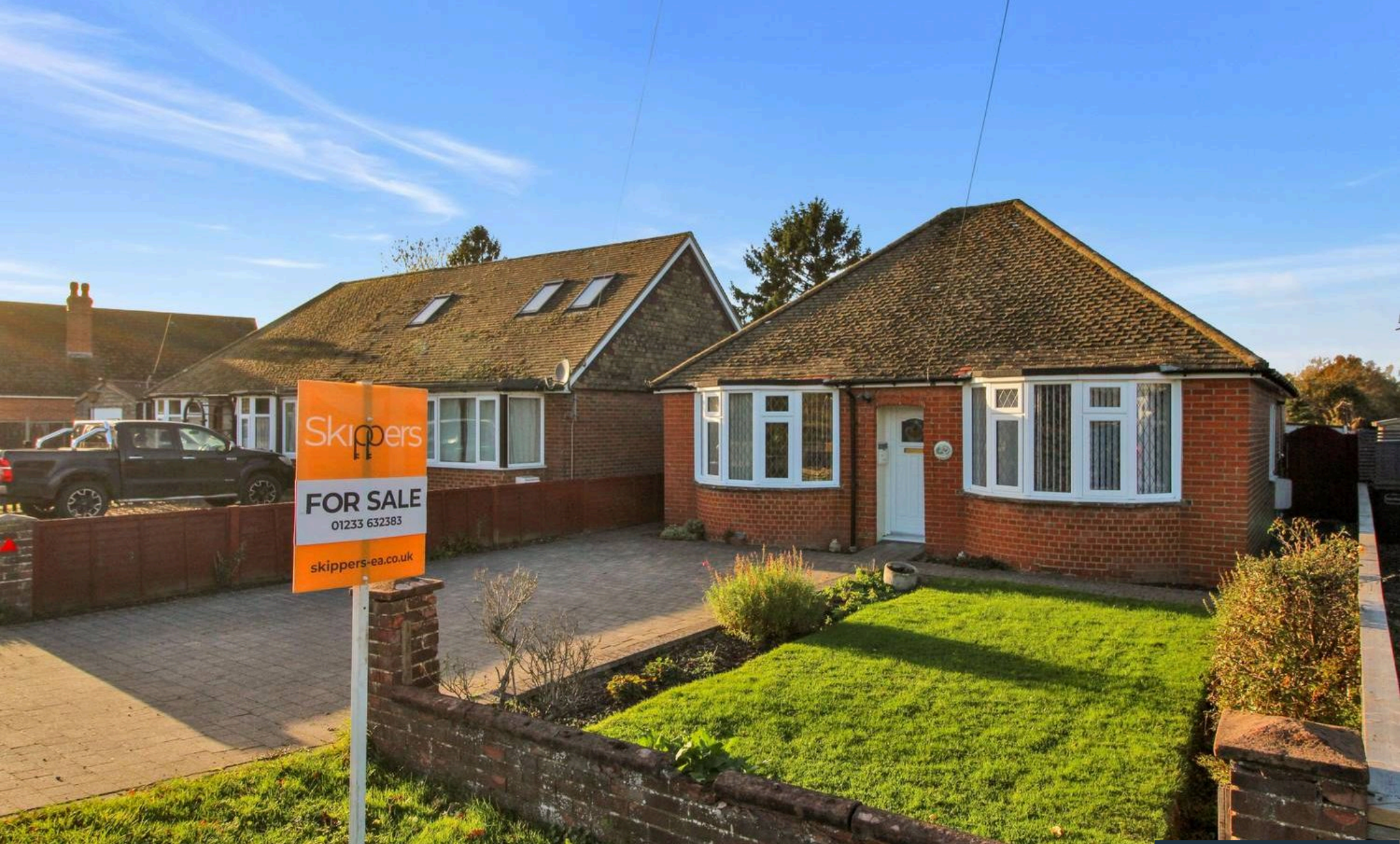
Fairstone Ashford Road, Kingsnorth £395,000